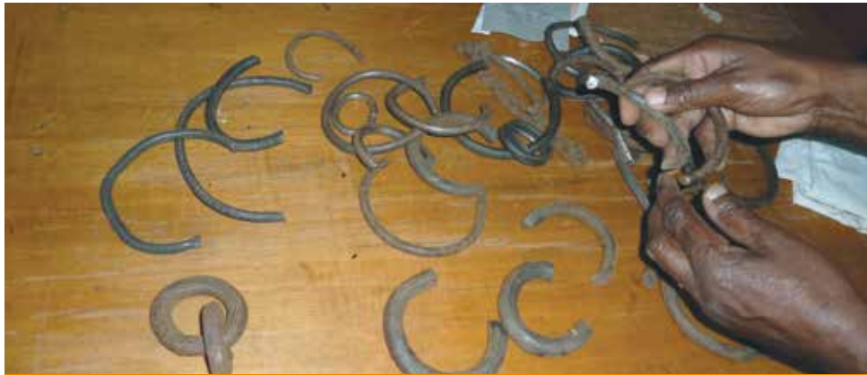
People in Uganda use these shackles to bring relatives to a psychiatric hospital.

Some children are born with an intellectual disability. Mental health issues can hit anyone. The number of people with dementia later in life are increasing everywhere. These conditions affect every family in the UK and abroad.